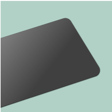
Matte UV (Flood Coated)